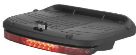
Brake light D0B40KL