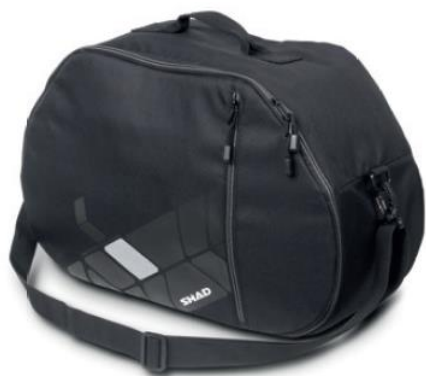
Inner bag X0IB00