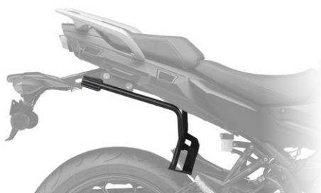
Specific 3P fittings