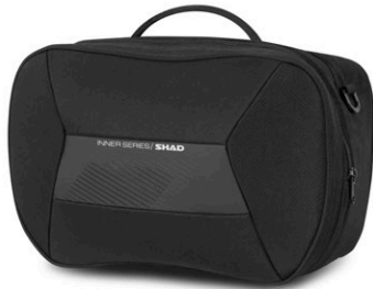
Expandable Inner Bag X0IB38