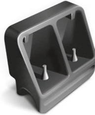
4P Fitting Adapter 204632R