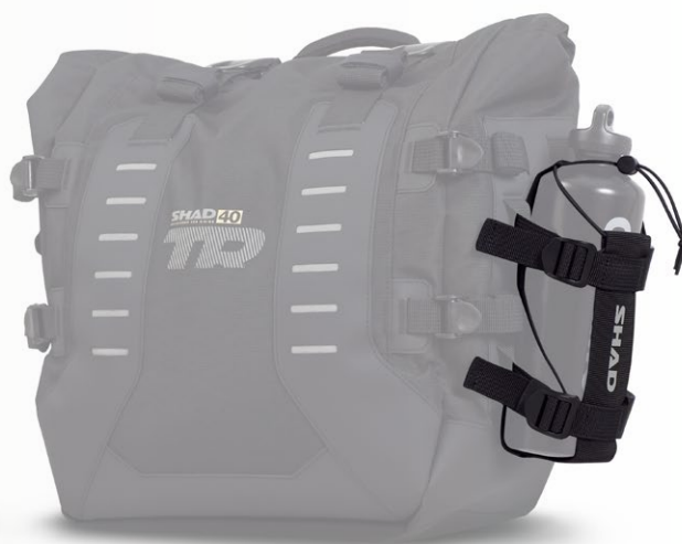
Fuel bottle harness