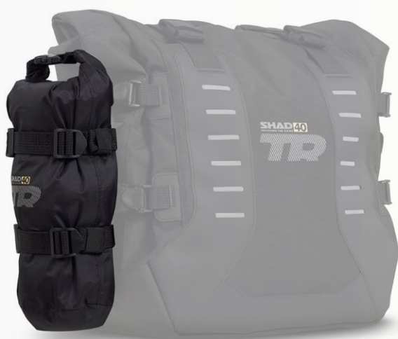
Dry bag + Bag holder