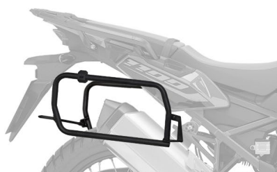
Specific 4P fittings